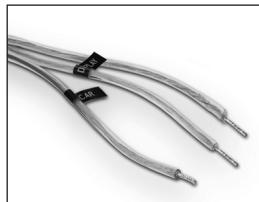
Assembly option : car and display