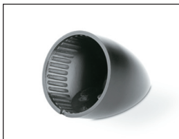
Tilted mounting Easy installation